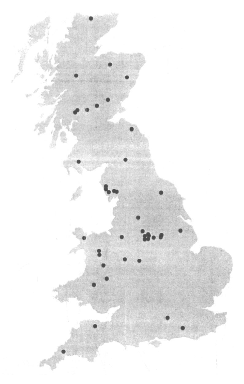
FIGURE 1 Distribution map of sampling sites in Britain.